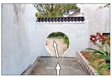
Figure 2: Pass through the small, round +40m Turn left immediately after the archway to your left.

second archway. You pass through a rock labyrinth after about 70m.