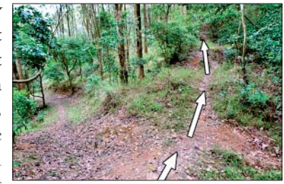
Figure 6: Take the central path steeply

+720m **ATTENTION** At the very small junction walk straight ahead slightly to the right along the small, overgrown path which climbs steeply, (Figure 6). Do not continue along the main path which goes down towards your left and ignore the very small path up the hill at the minor junction.