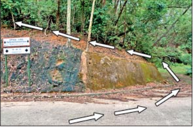
Figure 5: Follow the

+5000m **ATTENTION** Turn right at the road, walk about 10m and then turn left. Immediately on your left follow the 9 small concrete stairs twisting up the side of the hill, (Figure 5). There is a sign here labelled 'Shing Mun Forest Track - Reservoir Section. Your Location: KK the side of the hill.