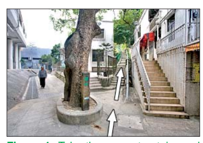
Figure 1: Take the concrete stairs and walk up the hill through the village.

+60m Continue uphill along the right branch of the path. Ignore the left branch of the path which is flat.